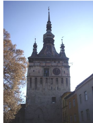
The clock tower in the citadel of Sighișoara

The population of the city is still minimally aware of energy issues, and the benefits to which it is entitled for investments in renewable energy or to increase energy efficiency of housing, through programmes 'inciting national and European. Indeed, the municipality has not established communication campaigns, a task that will déléguée to the agency. Moreover, Sighișoara didn't have any structure responsible for the management of energy consumption, nor an energy efficiency plan, which could permit the implementation of a top-down management of energy in the territory.