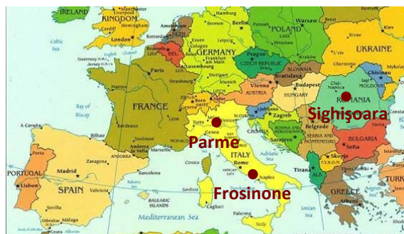
Les 3 agences de l'énergie partenaires